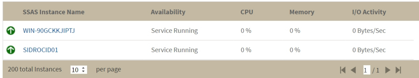
10 Most Active SSAS Service Instances

The SSAS instances roll-up view displays the following information: