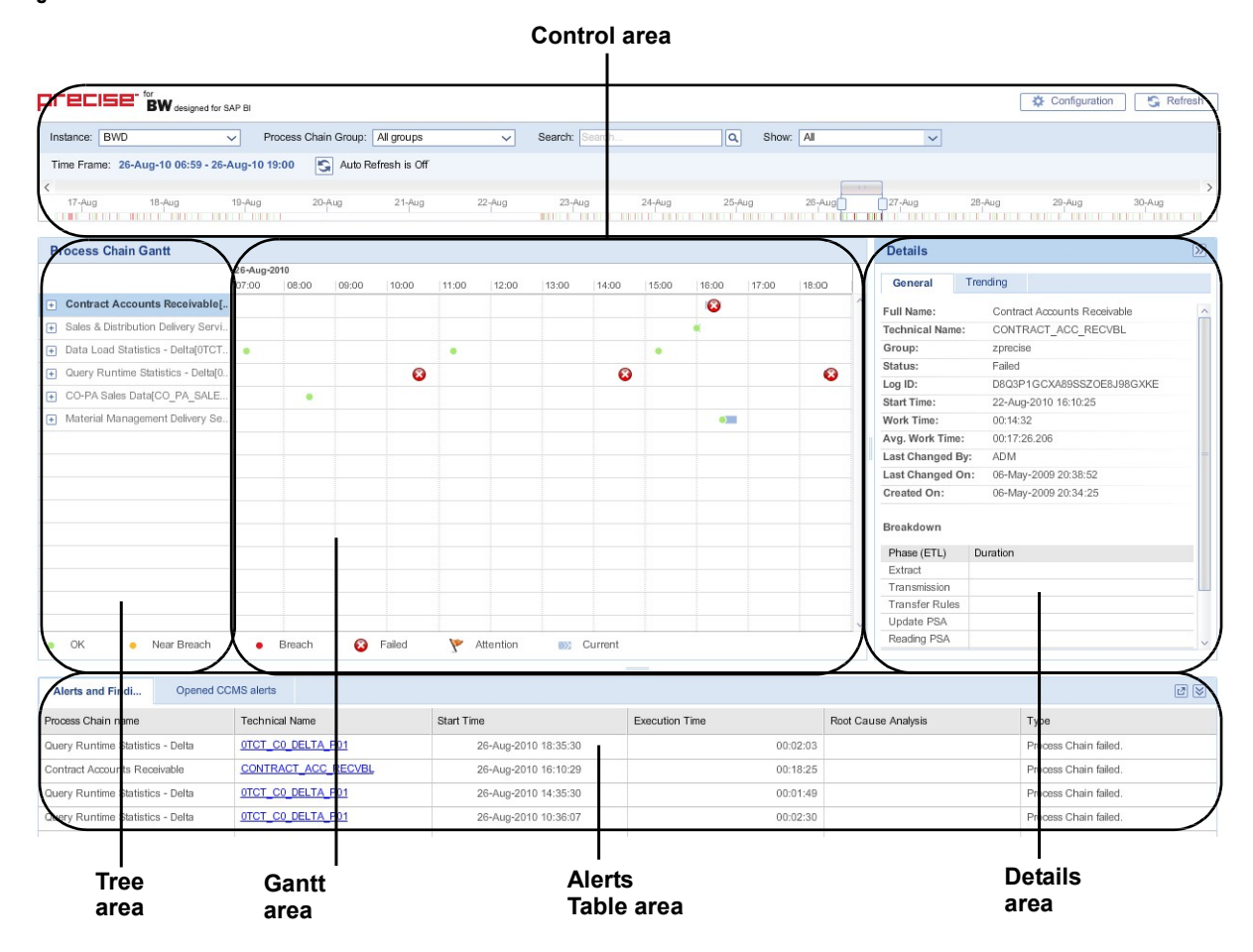
Figure 1-1 The Precise for BW user interface